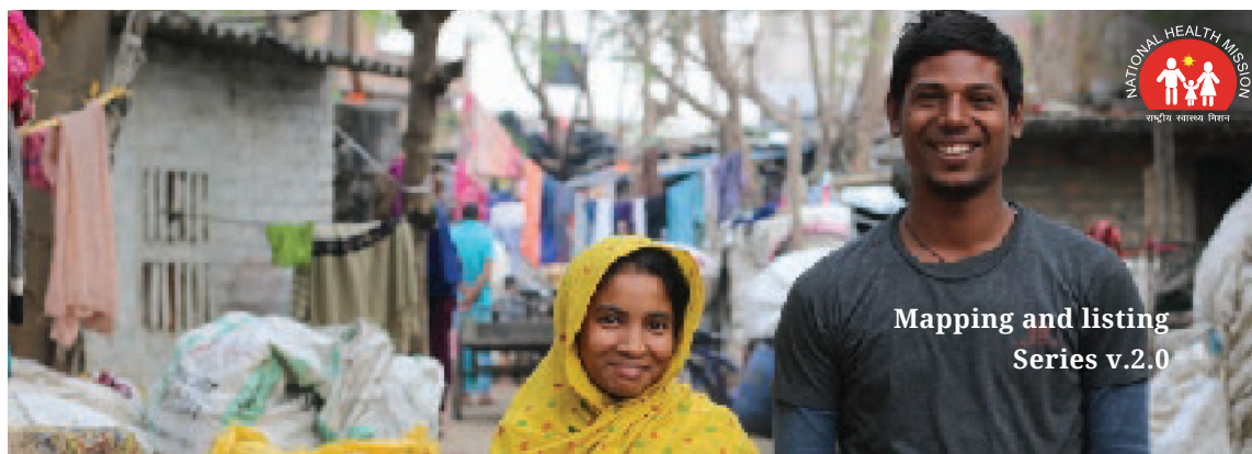
Mapping and listing Series v.2.0