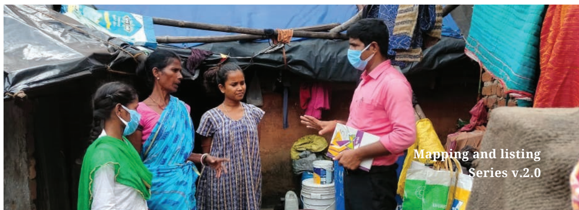
Mapping and listing Series v.2.0