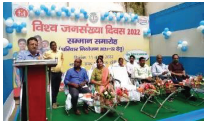
WPD UP, Bihar and Jharkhand