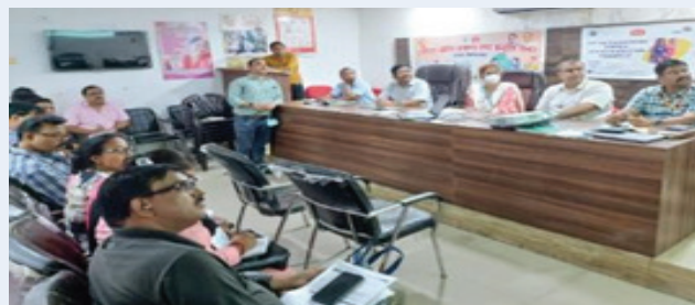
CCC members reviewing Firozabad's City Health Plan

Firozabad, City Government Officials (Integrated Child Development Scheme (ICDS), the District Urban Development Agency (DUDA), the Education department) along with UNICEF, WHO, and medical officers, reviewed the City Health Plan developed by NUHM in 2019-2020. The committee added new components to the city health plan in order to strengthen each aspect of the urban health system. Some key decisions from the review of