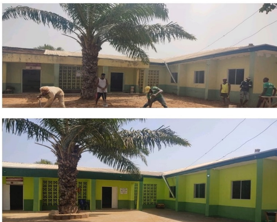
PHC Amiri in Nasarawa State before and after the 72-hour clinic makeover (Roof Repairs).

The 4 facilities renovated are Keana LGA - PHC Amiri & PHC Kadarko and Karu LGA- PHC Masaka & PHC New Karu. In addition to the structural upgrade, medical equipment, furniture and consumables were supplied to improve the quality of services. To ensure ownership and sustainability, the makeover processes were fully planned and supervised by the makeover team led by the Director Community and Family Health Services and comprising of state officers and TCI support team. There was full LGA and community participation as well towards ensuring the success of the makeover and community ownership and maintenance of the facility. The co-funding model implies that the state has adopted the TCI model and is willingly committing its own funds to ensure the improvement of FP services in the state. The state continues its plans to conduct 2 more health facility makeovers in a non-TCI LGA (Lafia LGA) in the coming months with full funding by the state government.